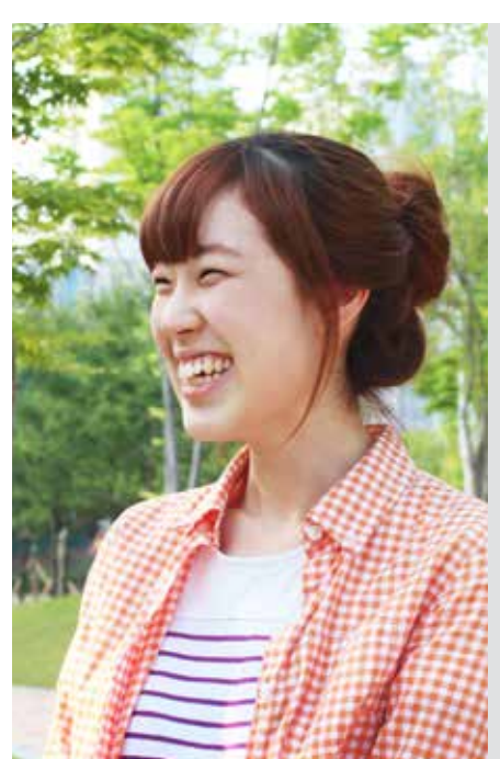
"Smiling is the way to make people closer to me.

Once I smile they cannot get away from me. "