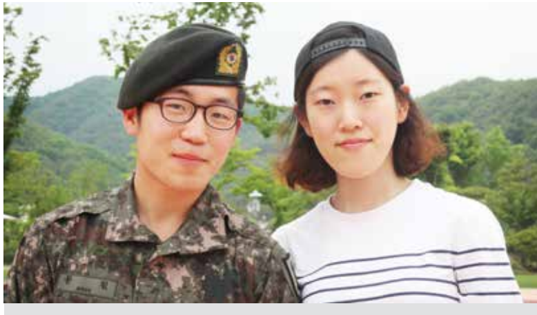
"We are going to KTX to go back to the military. I like her because she is cute."