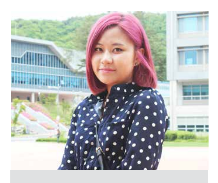
"If you are doing similar a project to 'Humans of New York', then I'm lucky. I love that blog. I colored my hair purple; because our professor said that design students should I have their own character. So I tried this color. Before now I felt uncomfortable when people looked at me, but now I enjoy the attention."