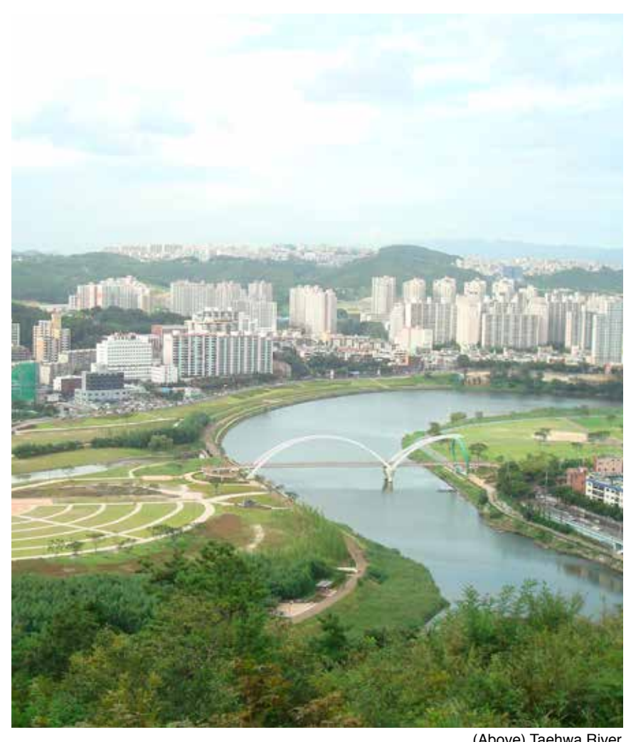
(Above) Taehwa River

Ulsan citizens and UNISTARS hope to see this place as another project of "the miracle of the Taehwa River." The only thing left is to fill in the needs of citizens by showing that this place actually is a miracle. To make it happen, not only the government should cooperate but also citizens should show enthusiasm towards it treating the site with respect.