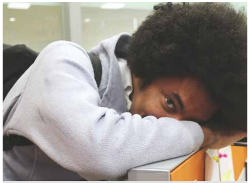
"If I care about other people, everyday morning I would have to think what I have to wear. So I care about people, but I don't care about what would think of me. I like my hair. In high school I could do some jokes to my friends by hiding their pens in my hair."