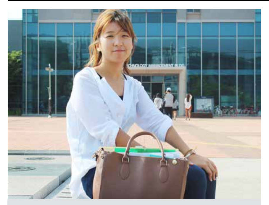
"I traveled around 15 countries, when people see me first in foreign countries they think I'm Chilean, because of my skin color. The change of my skin color from white to dark is a result of my traveling, and it is a memory. I mostly liked Egypt from all those countries. This summer I'm going to Nepal."