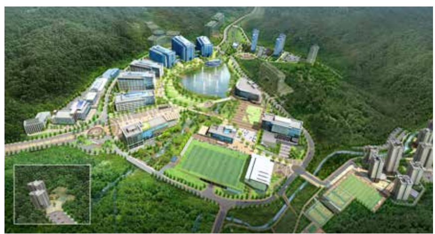
Bird's eye view of UNIST after the BTL construction