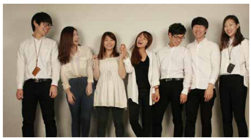
(Above) Designers from I:hope